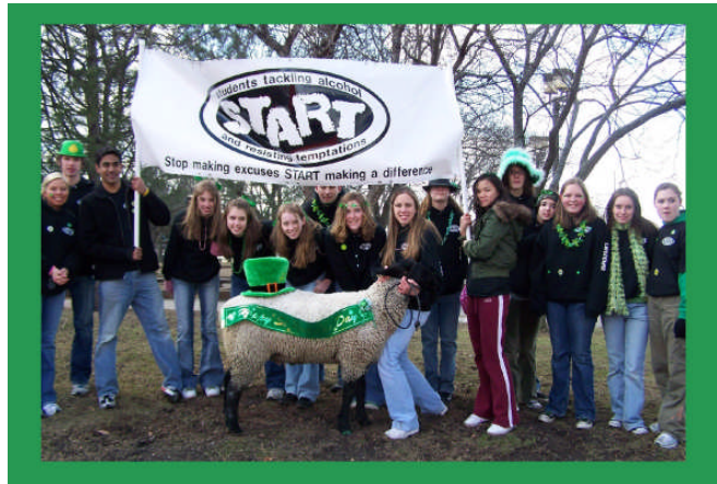
START youth in the St. Patrick's Day Parade in Bay City.