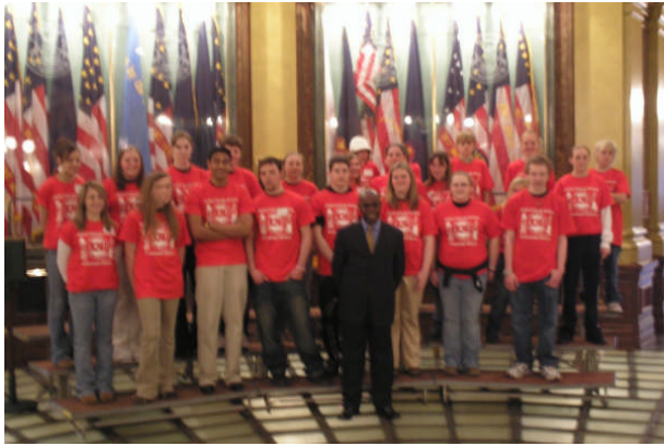
START youth at the Underage Drinking Prevention Rally at the Michigan State Capital.

START members are seeking to "grow" their organization to include all Midland County high schools. START youth strive to serve as "ambassadors" of our community and represent youth making positive choices.