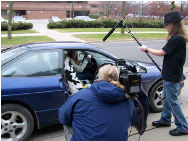
START youth assist in developing video psas with the help of GRIID.